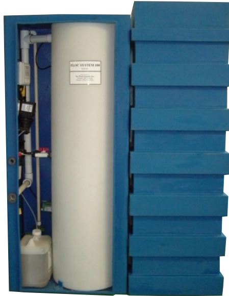
In-Home Unit: up to 900 IMP GPD