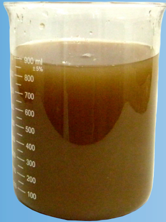
Untreated Water Sample

Reduce Taste, Color & Odor; Including suspended silts, decomposing & live algae, viruses & bacteria, cysts, solids & clay particles.