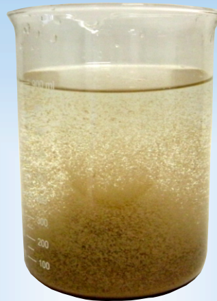
Minimal addition of flocculant

It combines with unwanted suspended matter forming floc, & separates leaving clarified water.